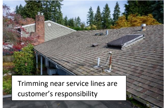
Trimming near service lines are customer's responsibility

Pike recommends you hire a qualified professional to cut down or trim vegetation near your service line. Be aware of overhead lines whenever you're doing any work outside. Look up and Look out for overhead lines.